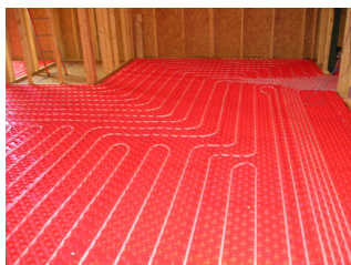
Floating Floor System