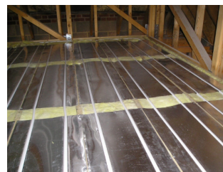
Timber Joisted Floor System